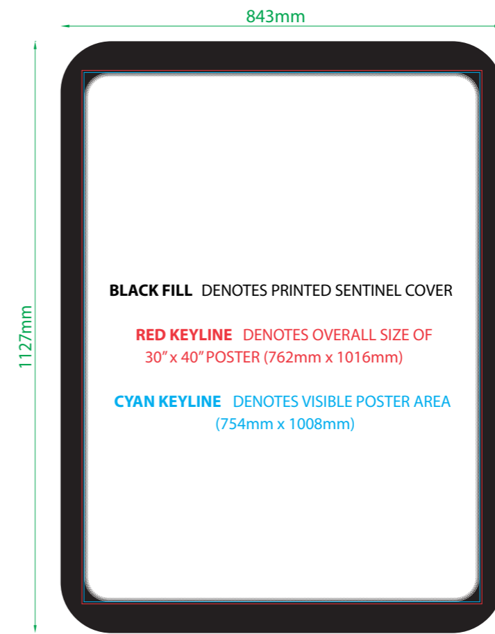
30" x 40"