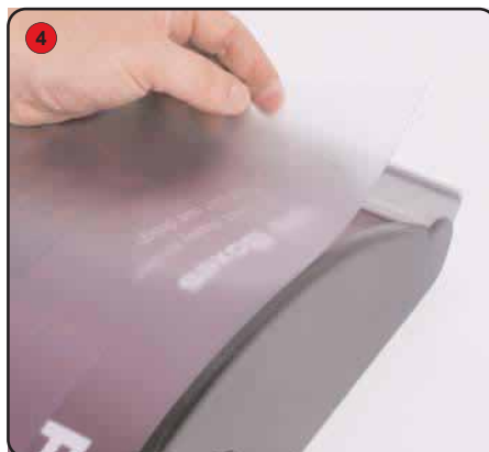
Re-fit the protective sheet over the graphic.