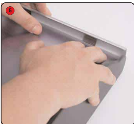
Close the snap frame sides to secure the graphic into place.