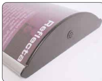
'D' shaped profile