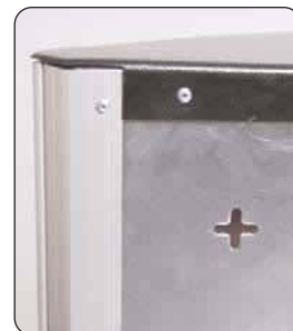
Screw ports for wall mounting