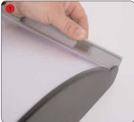
Open out both snap frame sides.

Before assembling or changing graphics ensure the unit is disconnected from the power supply.