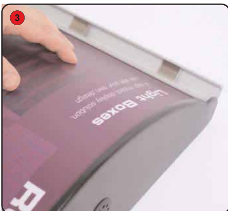
Fit the graphic into the lightbox.