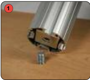
1 Insert screw through base