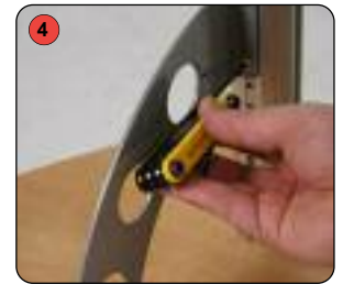
4 Attach curved leg to base and round posts