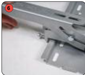
6 Attach LCD brackets to LCD bracket backboard.