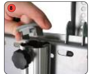
8 Post end caps can be removed to help fit the LCD bracket