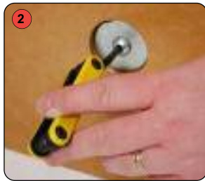
2 Tighten to 50mm round posts