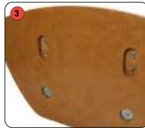
3 Fix all screws to round posts through base