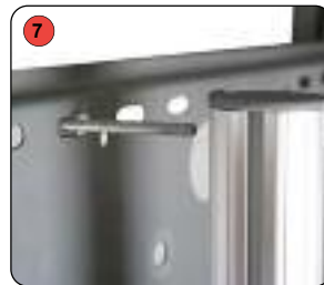
7 Attach LCD mount to 50mm round posts with M6 x 70mm screws, penny washers, flat washers, spring washers, and thumb wheels.