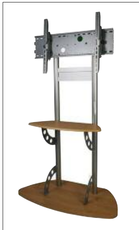
(Optional shelf shown, monitor not included)

Available in Birch, silver and Black base colour options.