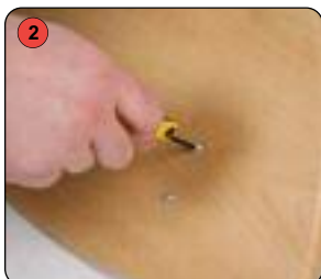
2 Attach supports to shelf