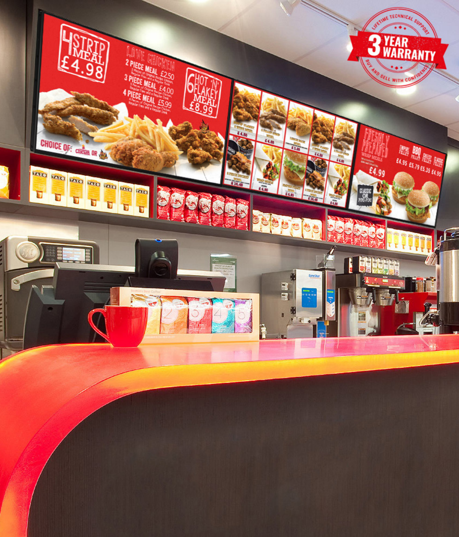
50" Network Digital Menu Board