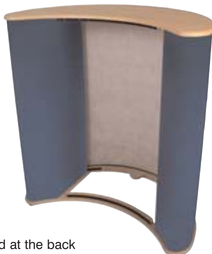
Crescent can be open or closed at the back