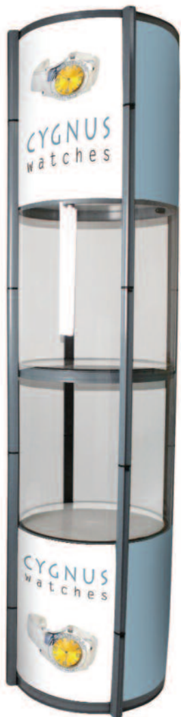
(NB Graphics are not supplied)