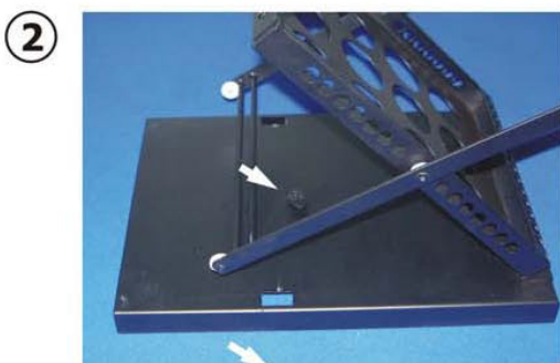
2 Locate both tray supports into the base cutouts