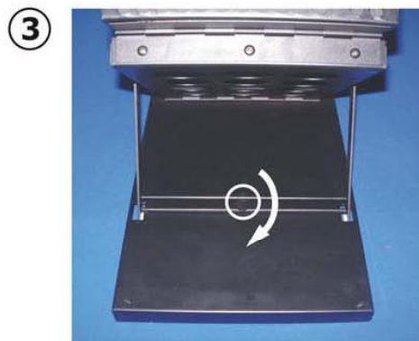
Rotate locking tab over the horizontal bar to lock the base into place