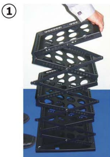
1 Raise the unit by gently lifting the top tray