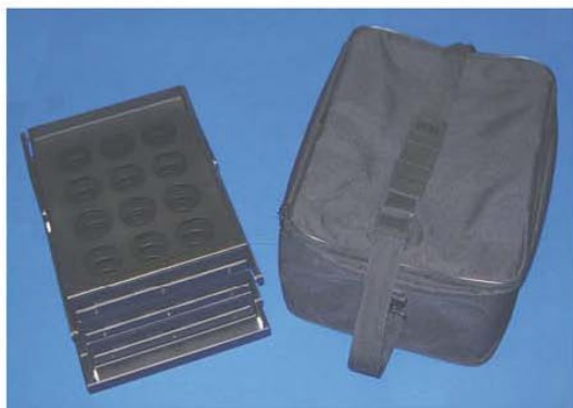
kit includes : a4 zedup & carry case

Caution: Ensure fingers are kept clear of folding mechanism when opening and closing this unit