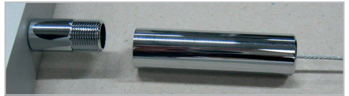
Fastening the wire system at the bottom