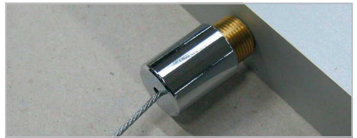
Fastening the wire system at the top