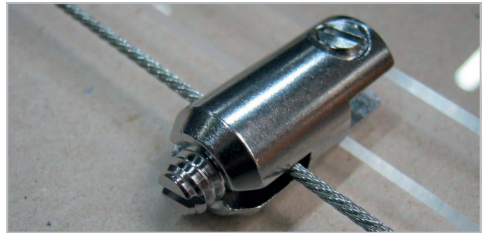
Attach the acrylic pockets to the cable system by means of the pre-mounted connectors