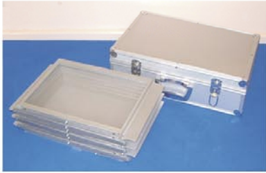
Zedup lite in folded position with carry case

Caution: Ensure fingers are kept clear of the folding mechanism when opening and closing this unit