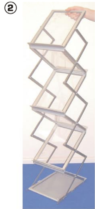
Extend the stand to its full height

① Holding the top tray, gently raise the trays upwards Place your foot on the base to provide stability