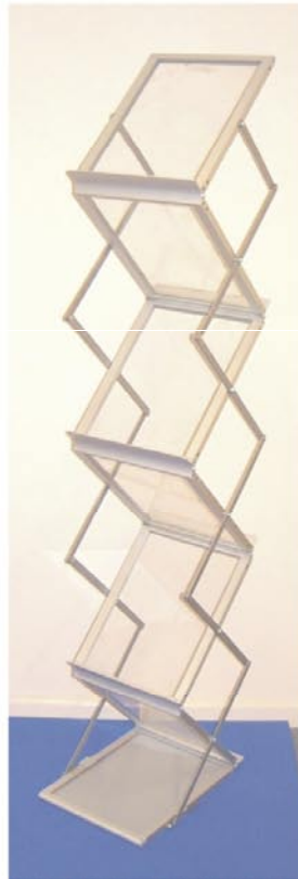
Assembled Zedup Lite

④ Lock the the base into position by sliding the 'U' shaped tabs over the slider bars