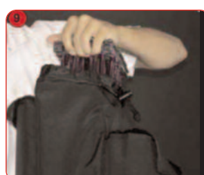
9 Pull out the Quick mini unit