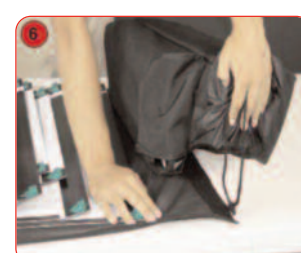
6 Tear off the bag that is attached to the end of the wrap