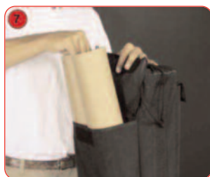
7 Pull out the optional lights from the side pocket of the bag