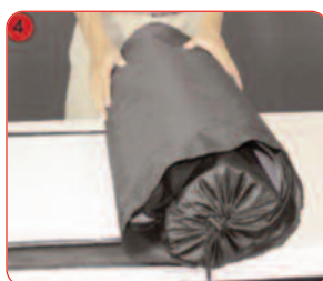
4 Unroll the bag until the full unwrapped