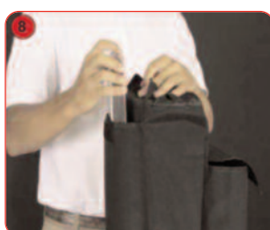
8 Pull out the mag bars from the other side pocket