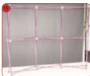
11 Open it up all the way until the arms lock into place