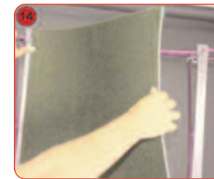
14 Attach the main panels