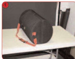
1 Here is the Quick mini tabletop packed up