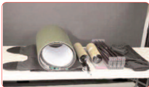
Kit Includes: Mini Quick frame, mag bars, hangers and kickers, frame and mag bar bag and Padded bag