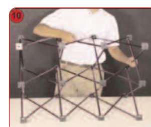
10 Lay the Quick mini on its side and pull the top bar up