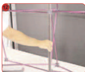
12 Put the mag bars on the frame. Cover the front, and the two back corners