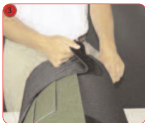
3 Open the wrap using the hook and loop