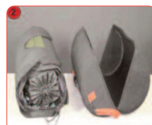
2 Pull out the panel wrap from the outer case