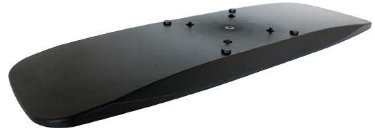
Middle 19,5x60,5 cm Material: ABS Weight: 0,510kg