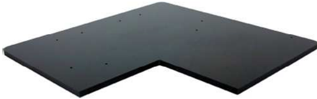
Shelf, L shape Material: PMMA Weight: 1,95kg