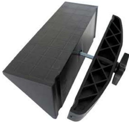
Shelf holder Material: ABS+Steel Weight: 0,260kg