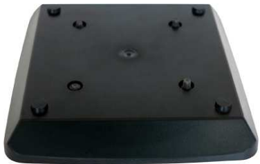
Regular 19,5x19,5 cm Material: ABS Weight: 0,195kg