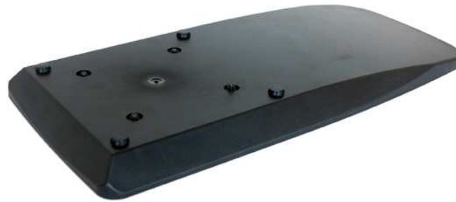
Side 19,5x40 cm Material: ABS Weight: 0,360kg